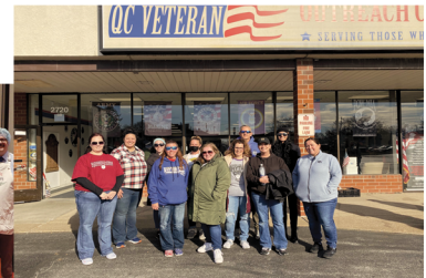
QC Veterans Outreach Center

Beyond the benefits of a gaming revenue sharing contract between RDA and the Casino, Rhythm City Casino Resort has an even larger impact on the Quad Cities economy. Rhythm City Casino Resort employs 450+ with an annual payroll and benefits of $19.0 million per year. This scale of economic activity creates ripple effects for the entire region.