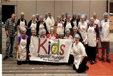
Kids Against Hunger